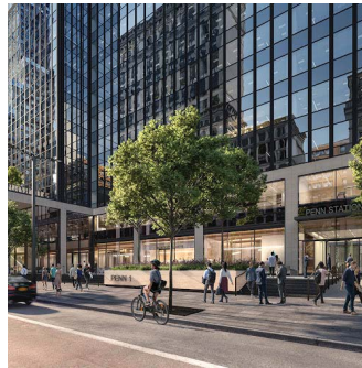
New York, New York