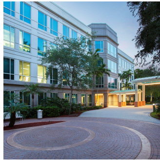
Boca Raton, Florida