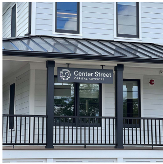
Chatham, New Jersey