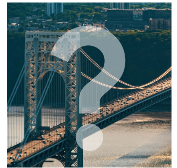
Bergen County, NJ?